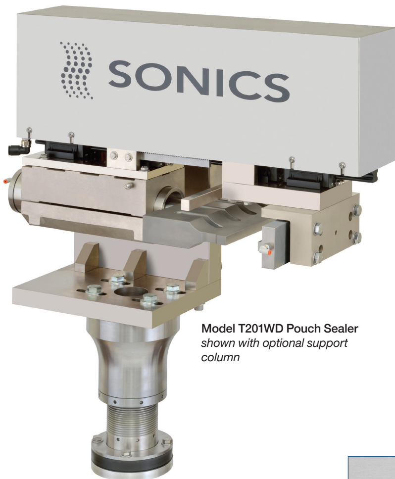
Model T201WD Pouch Sealer shown with optional support column