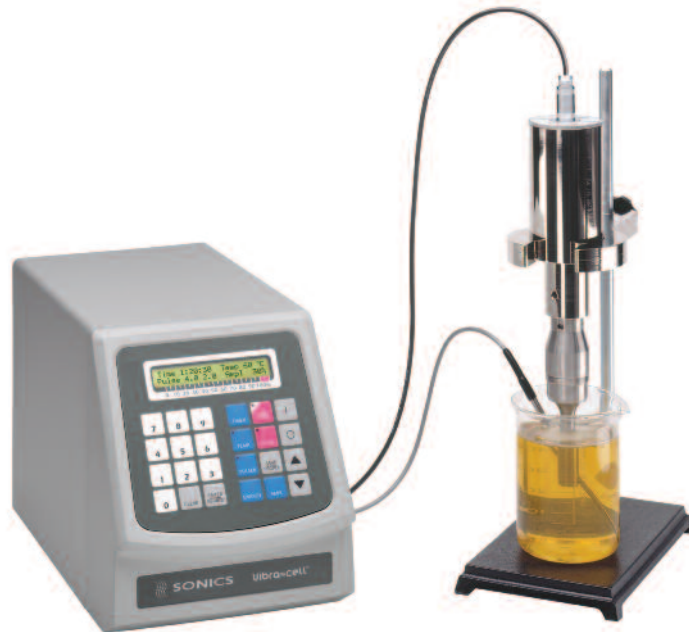
VCX 500 – VCX 750