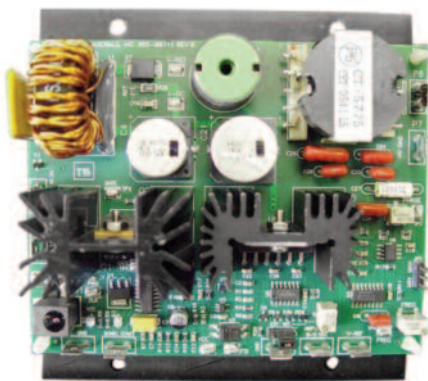
50 WATT BOARD (with mounting plate)

Overall dimension: 4.75" (120.7mm) W x 4.75" (120.7mm) L x 2.2" (56mm) H